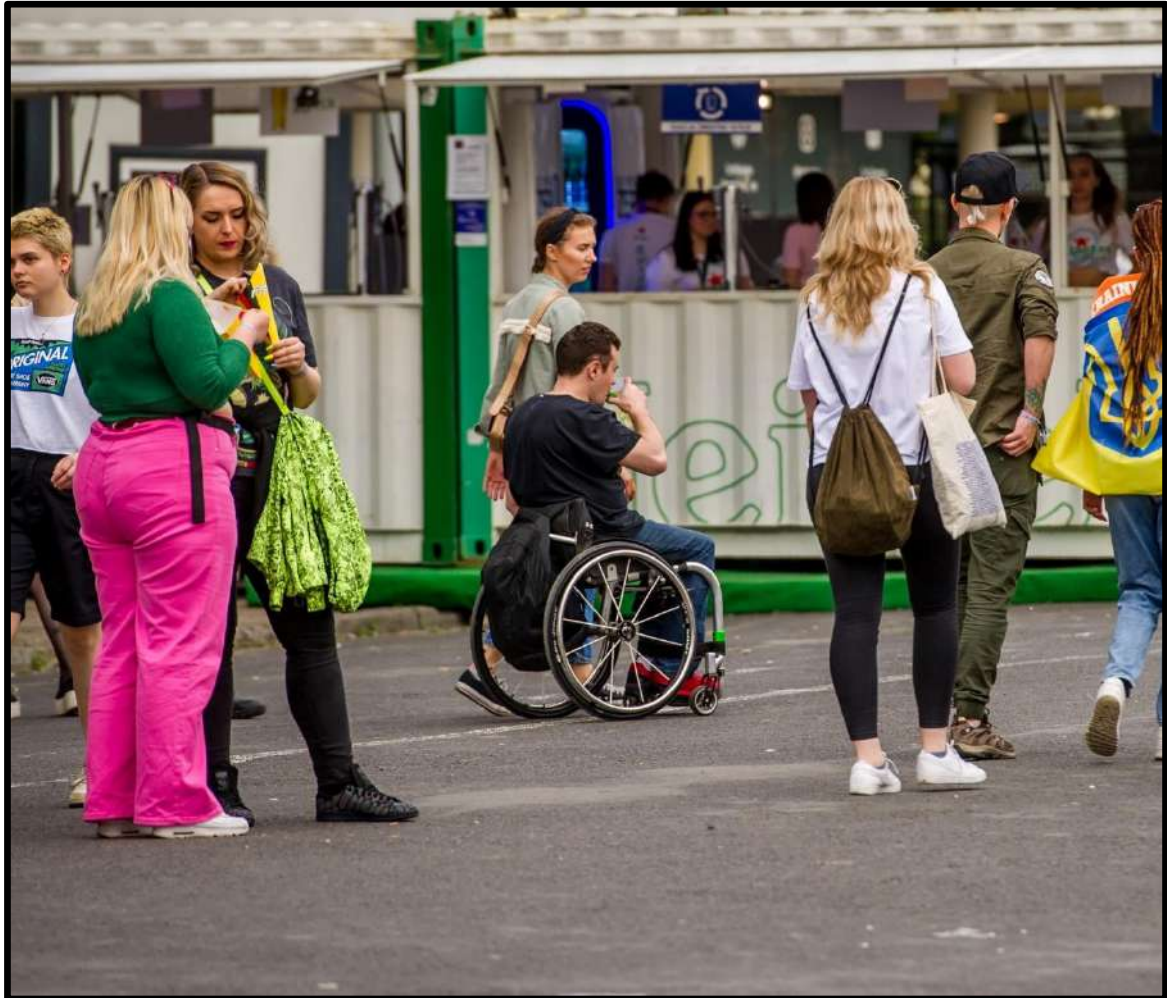
A group of people at the festival.